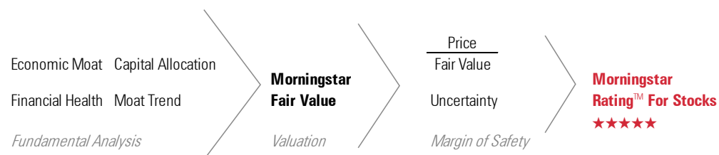
Exhibit 1 Morningstar Research Methodology

We believe that a company’s intrinsic worth results from the future cash flows it can generate. The Morningstar Rating for stocks identifies stocks trading at a discount or premium to their intrinsic worth--or fair value estimate, in Morningstar terminology. Five-star stocks sell for the biggest risk-adjusted discount to their fair values, whereas 1-star stocks trade at premiums to their intrinsic worth. Four key components drive the Morningstar rating: our assessment of the firm's economic moat; our estimate of the stock's fair value; our uncertainty around that fair value estimate; and the current market price. This process ultimately culminates in our single-point star rating. Underlying this rating is a fundamentally focused methodology and a robust, standardized set of procedures and core valuation tools used by Morningstar's equity analysts, including our Capital Allocation rating. In this document, we provide a detailed overview of how the Morningstar Rating for Stocks is derived, and also outline the analytical work that feeds into our coverage of stocks.